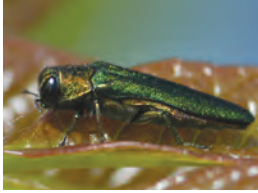
EAB adults must feed on foliage before they become reproductively mature.

may also result in puddles of insecticide that could wash away, potentially entering surface water or storm sewers. To further protect surface and ground water, soil applications should not be made to excessively sandy soils with low levels of organic matter that are prone to leaching, especially where the water table is shallow, or where there is risk of contaminating gutters, ditches, lakes, ponds, or other bodies of water.