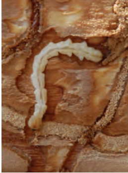
EAB larvae damage the vascular system of the tree as they feed, which interferes with movement of systemic insecticides in the tree.

greater than 15 inches at a rate that is twice as high (2× rate) as the rate used for smaller trees (1× rate). In an OSU study in Toledo conducted from 2006–2014, imidacloprid soil drenches effectively protected ash trees ranging from 15–22 inches in diameter when applied at the 1× rate in spring, or at the 2× rate when applied in either the spring or fall. These treatments were effective even during years of peak pest pressure when all of the untreated trees died. Trees treated in fall with the 1× rate, however, declined and had to be removed.